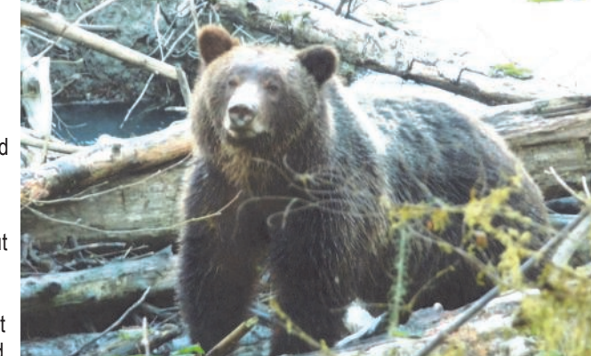
"watching us while we were watching him".

Canada is a lovely friendly country, very similar in lots of ways to New Zealand but ever so much larger and with a different climate. Vancouver has one of the most stable climates in Canada we were told, their grass grows and flowers bloom all year around as the temperature does not vary much.