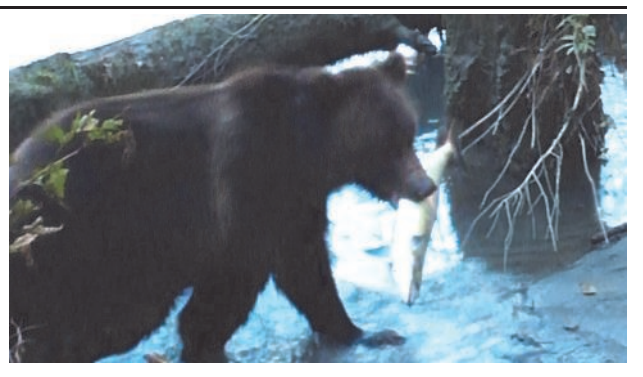
Bear with salmon in the Bute River.

Our flight back to New Zealand the following day left Vancouver on time in the late afternoon and was smooth and comfortable. We lost a day on our return journey and landed at 4.30am a little ahead of the expected time. A